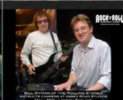
BILL WYMAN OF THE ROLLING STONES INSTRUCTS CAMPERS AT ABBEY ROAD STUDIOS MAY • 2006 • LONDON, ENGLAND