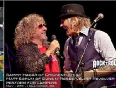
SAMMY HAGAR OF CHICKENFOOT & MATT SORUM OF GUNS N' ROSES PERFORM FOR CAMPERS MAY • 2008 • HOLLYWOOD, CA