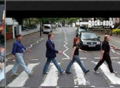
CAMPERS CROSS ABBEY ROAD MAY • 2010 • LONDON, ENGLAND