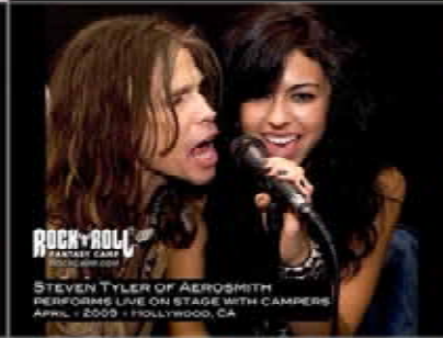
STEVEN TYLER OF AEROSMITH PERFORMS LIVE ON STAGE WITH CAMPERS APRIL • 2009 • HOLLYWOOD, CA