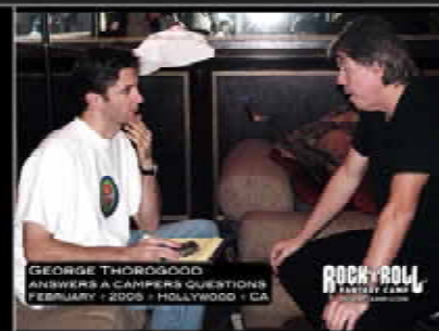
GEORGE THOROGOOD ANSWERS A CAMPERS QUESTIONS FEBRUARY • 2005 • HOLLYWOOD • CA