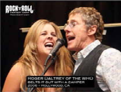
ROGER DALTREY OF THE WHO BELTS IT OUT WITH A CAMPER 2006 • HOLLYWOOD, CA