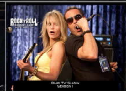
OUR TV SHOW SEASON 1