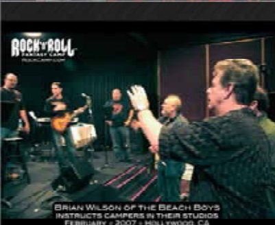
BRIAN WILSON OF THE BEACH BOYS INSTRUCTS CAMPERS IN THEIR STUDIOS FEBRUARY • 2007 • HOLLYWOOD, CA