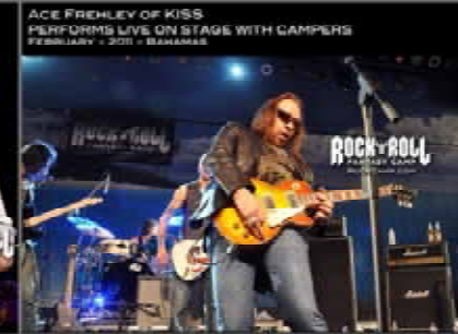
ACE FREHLEY OF KISS PERFORMS LIVE ON STAGE WITH CAMPERS FEBRUARY • 2008 • BAHAMAS