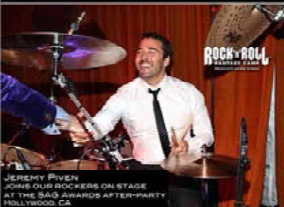
JEREMY FIVEN JOINS OUR ROCKERS ON STAGE AT THE SAG AWARDS AFTER-PARTY HOLLYWOOD, CA