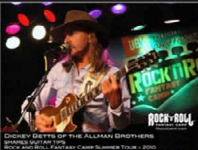
DICKEY BETTS OF THE ALLMAN BROTHERS SHARES GUITAR TIPS ROCK AND ROLL FANTASY CAMP SUMMER TOUR • 2010

3 & 5 Day Destination Camps ★ Rock Star For A Day Experience in Las Vegas ★ Corporate Team Building