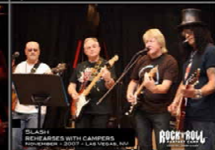
SLASH REHEARSES WITH CAMPERS NOVEMBER • 2007 • LAS VEGAS, NV