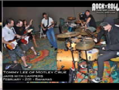
TOMMY LEE OF MOTLEY CRUE JAMS WITH CAMPERS FEBRUARY • 2001 • BAHAMAS